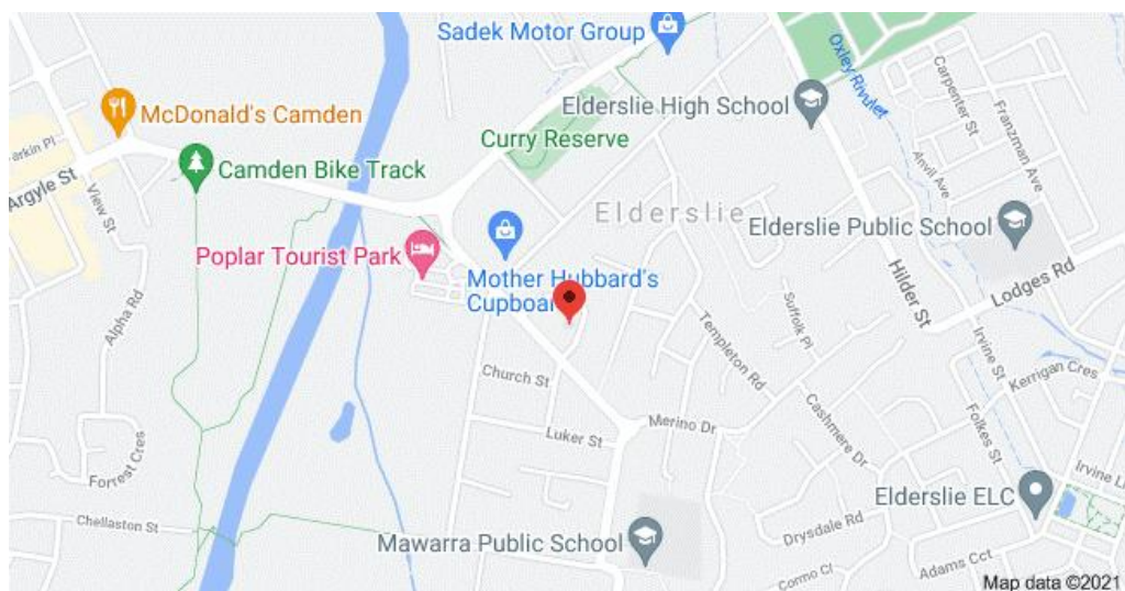
Figure 1: The location of the subject site (www.googlemaps.com).